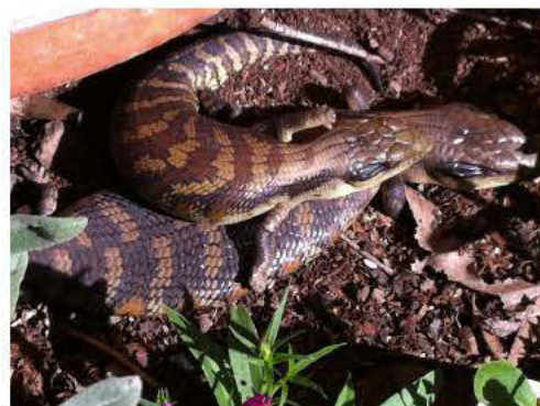
Blue tongue lizards on Saturday 9 June 2012 - very welcome garden members!